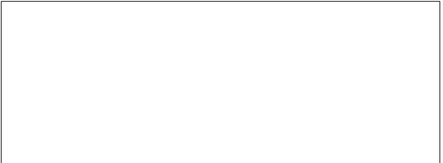
DRAW A PICTURE OF YOUR JOB